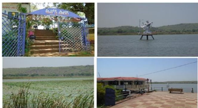
Fig 2. Ashok Sagar Lake - Over View