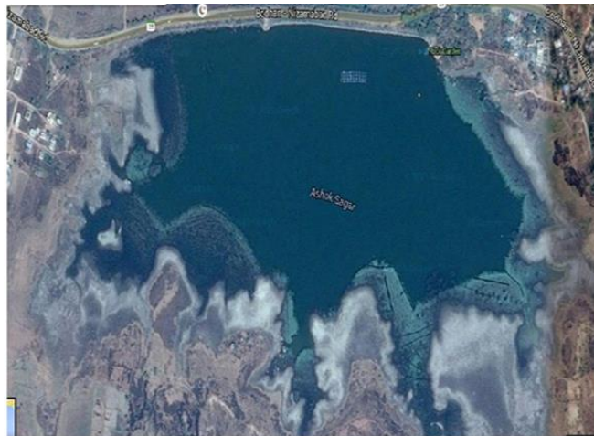
Fig 1. Ashok Sagar Lake - Sateliite View

according to standard methods of (APHA, AWWA, WEF, 2005). Phytoplankton were examined and identified with the help of classified manuals (Desikachary,1959; Anand,1998 ; Krishnamurthy, 2000).